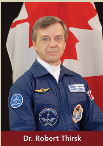
Dr. Robert Thirsk

about working in space for six months aboard the International Space Station?